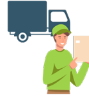
Last mile delivery