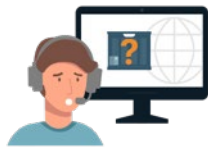
Supply chain visibility