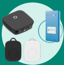
Right sensor for the right asset

Works on nearly all Bluetooth-enabled devices and tags.