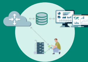
Feeds into existing systems

Transforms any Bluetooth-enabled device into a tracker and gateway.