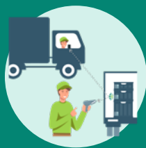
No additional infrastructure

Works on nearly all Bluetooth-enabled devices and tags.